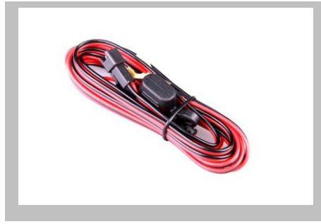
Charging cable (Standard)