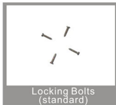
Locking Bolts (standard)