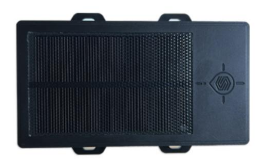
GF70 with Solar Panel(2G/4G)