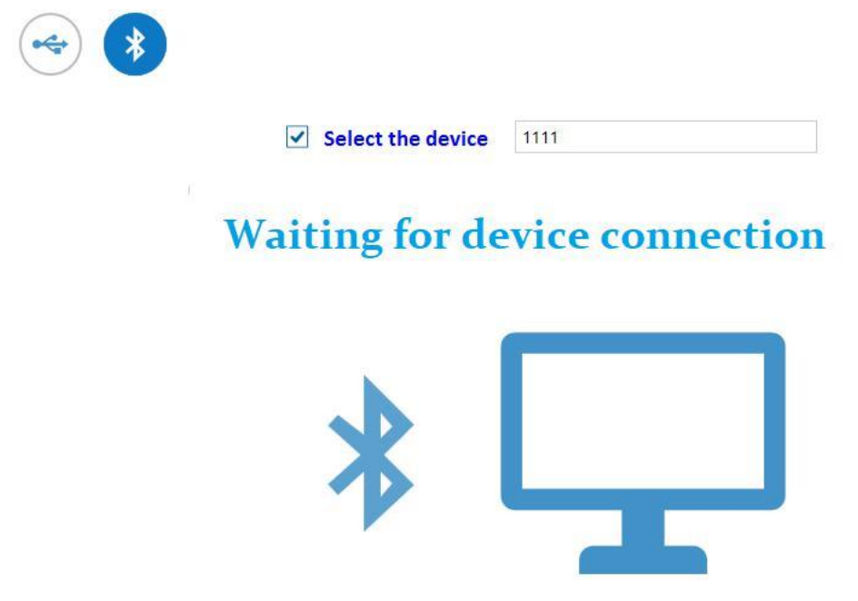
Figure 5 - ADM Configurator in device connection standby mode