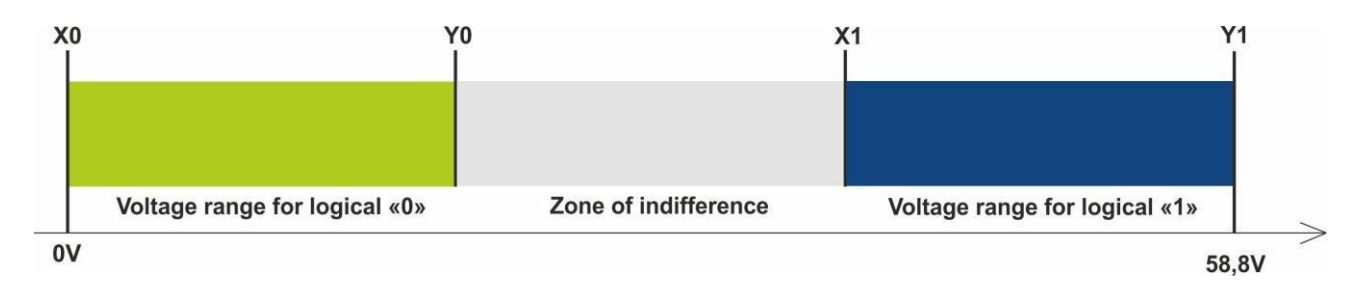
Figure 7 - Bands of discrete states

Y1 - the upper limit of the logical range "1" (fixed value of 60000 mV) When entering these commands, the voltage must be specified in millivolts.