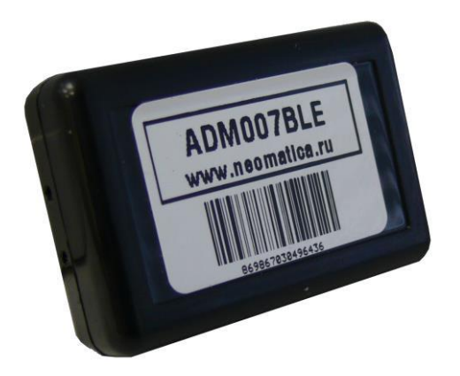
Figure 1 - View of the tracker (the wires are not shown)

To ensure data security, when the external power is turned off and the GSM network is lost, the tracker has non-volatile memory. Data transmission is possible only if there is a GSM 850/900/1800/1900 cellular network supporting a packet data service (GPRS).